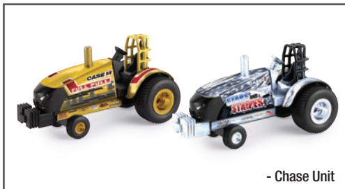
- Chase Unit

Tractor pulling is a competitive motor sport in which farm tractors are the main feature. Featuring exciting graphics, roll bar, and oversized tires allowing the littlest collector to have great adventures.