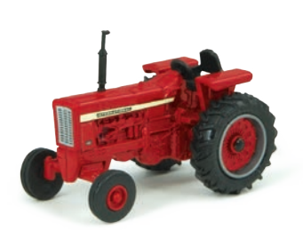
1:64 International Vintage Tractor

Part No. ZFN46573 Case Pack: 12 - Age grade 3+