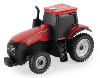
1:64 Case IH AFS Connect™ Magnum™ 380

Part No. ZFN46502 Case Pack: 4 - Age grade 3+