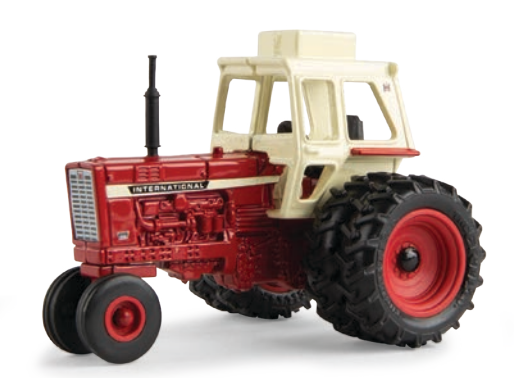
1:64 International Harvester™ Farmall® 856