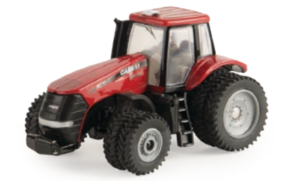
1:64 Case IH Modern Tractor

Part No. ZFN46573 Case Pack: 12 - Age grade 3+