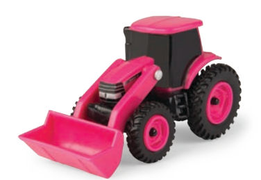
1:64 Pink Loader Tractor

Part No. ZFN47166 Case Pack: 4 - Age grade: 3+